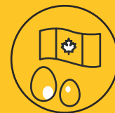
EGG + CANADA FLAG BONUS